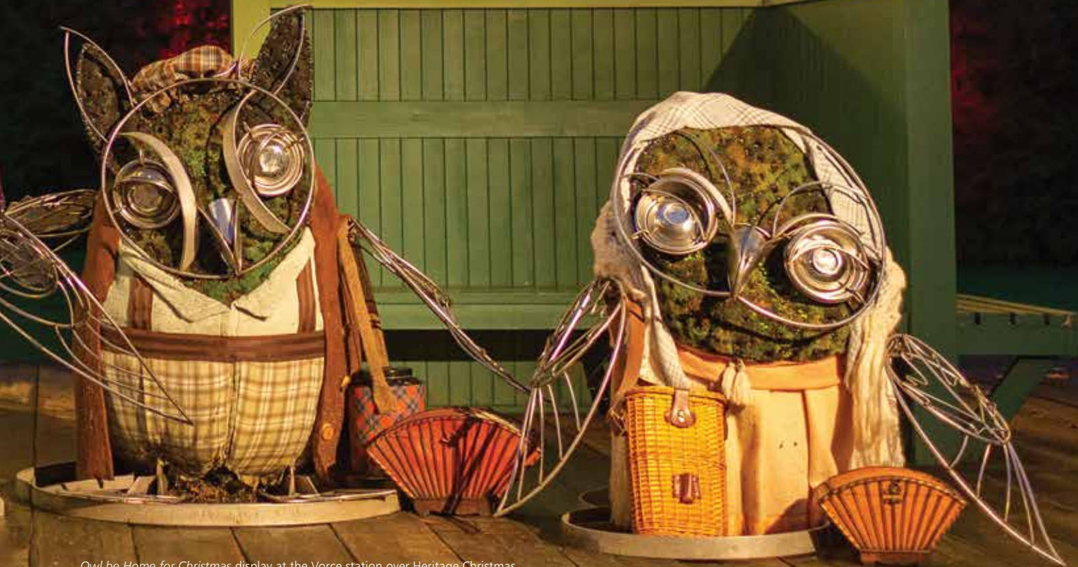
Owl be Home for Christmas display at the Vorce station over Heritage Christmas