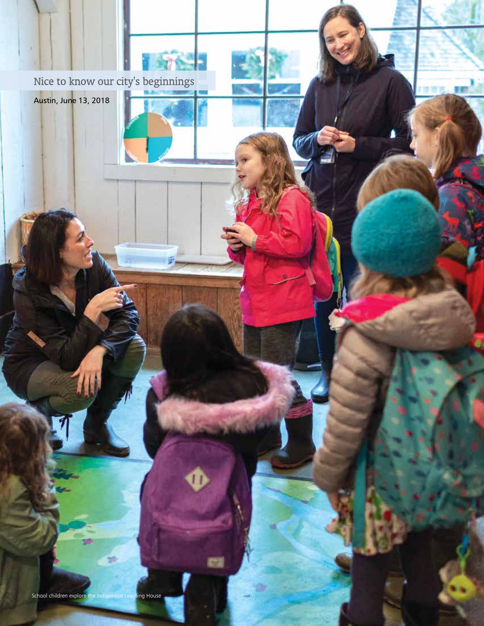
School children explore the Indigenous Learning House