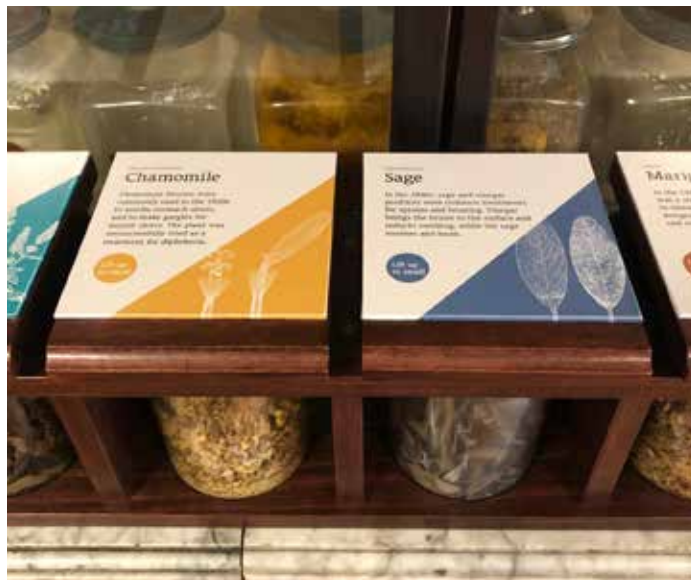
Smell station interactive in the pharmacy exhibit

New LED track lights were installed that will better enable staff to control light levels to minimize light exposure to artifacts on display.