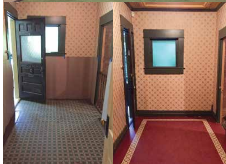
(top and middle) Love Farmhouse Dining Room: Before & After (bottom left to right) Love Farmhouse Entrance: Before & After